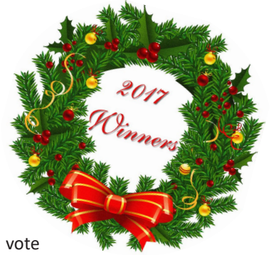
2434 Kings Point Dr.

ended on a high note for the Beautification Committee with the 3rd Annual Holiday Decoration contest. Committee members agreed that there were more decorated homes this year with elaborate displays, making the choice of the top 10 quite difficult but more fun! Our 10 nominees (5 from each side of Tilly Mill) were photographed and posted on