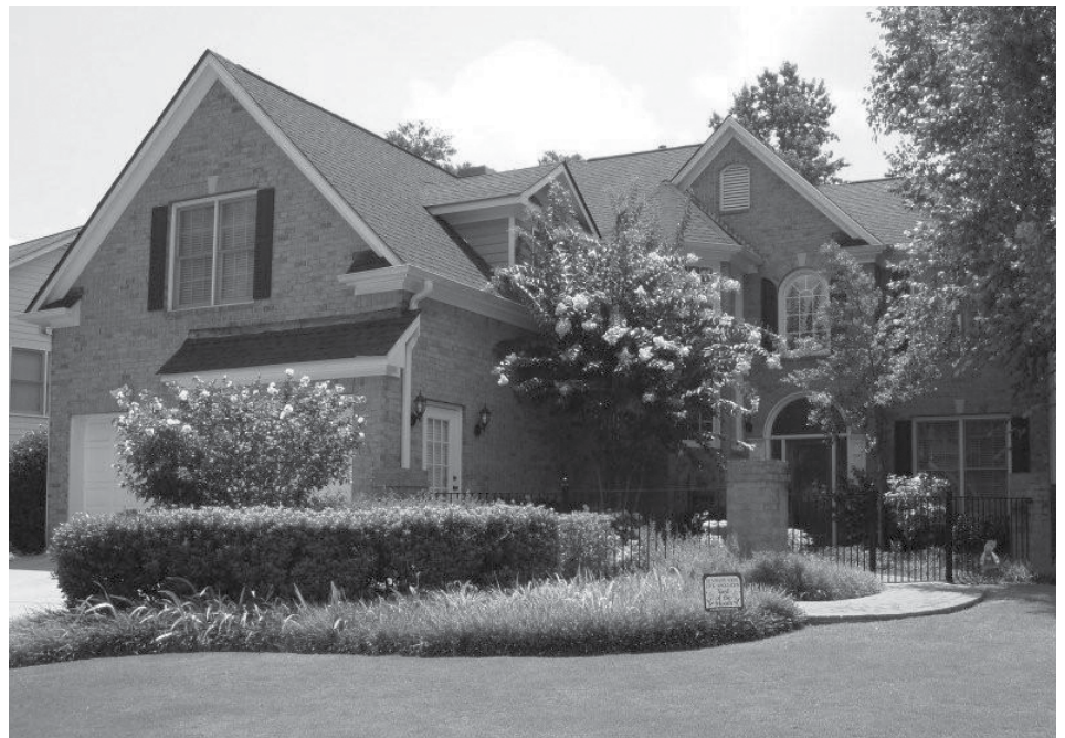
DNCA's July Yard Of The Month

The committee has set a couple of goals for the 2011 season including improved signage for our recipients and car magnets to designate judges' vehicles. Without a budget, we depend on donations to help us reach these goals. You can donate by visiting the plant exchange. Further details regarding the date, time, and donations will be available at the DNCA Annual Meeting on February 22nd. We look forward to seeing you there and sharing ideas that will keep Dunwoody North a beautiful place to live.