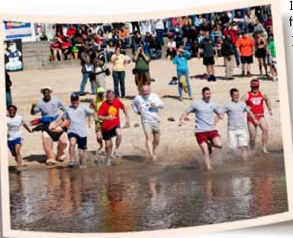
Polar Plunge, February 2010

You can also follow the 2011 Polar Plunge at www.facebook.com/polarplungega , www.twitter.com/polarplungega and.....learn more about Law Enforcement Torch Run at: www.specialolympicsga.org